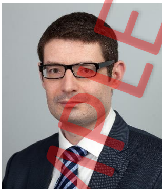
John Doe, MD